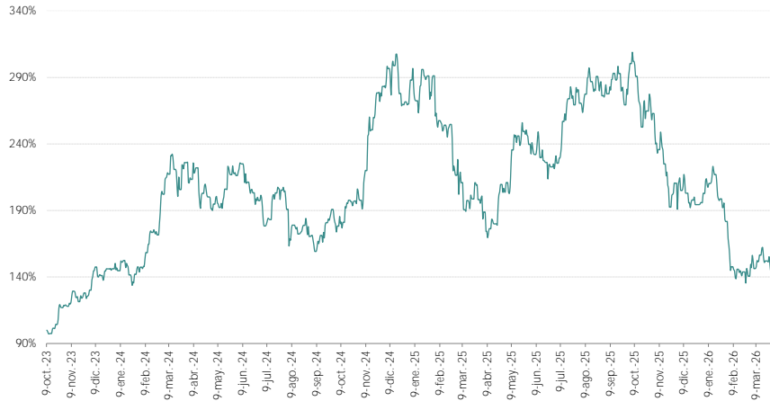
(*) Class A (ES0124722002) is shown till 20/03/2026